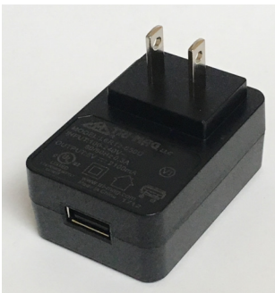
USB Wall Adapter